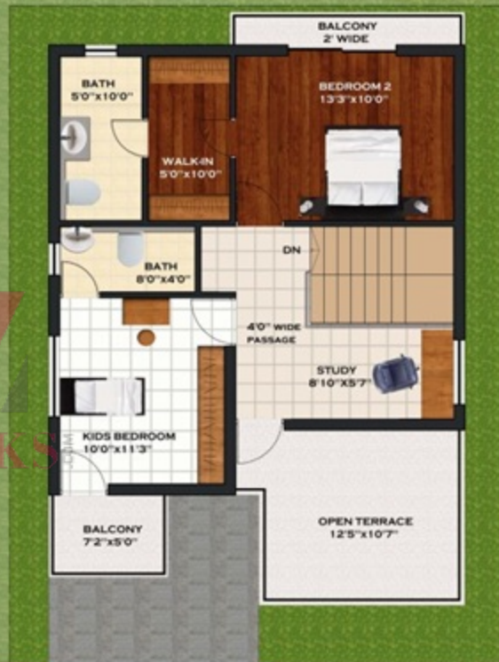
FIRST FLOOR PLAN 30x40 VILLA - 3 BED ROOM