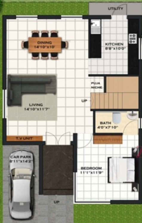
GROUND FLOOR PLAN 30x40 VILLA - 3 BED ROOM